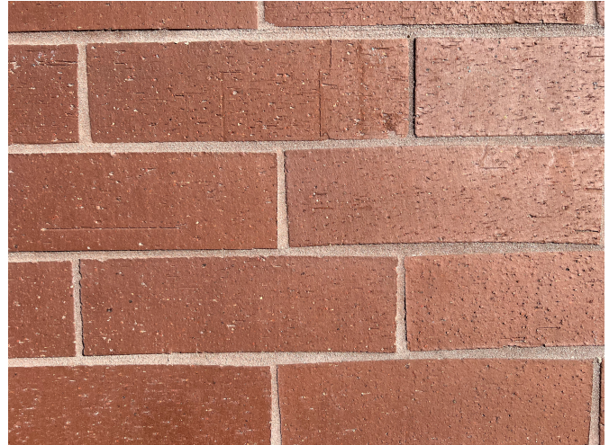
Detail of wall texture